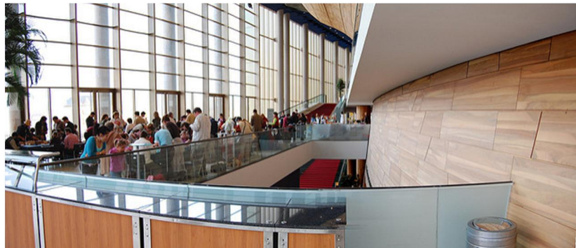
Palace of Arts.

📍 Budapest is a home to the Palace of Arts, a new cultural hub that opened its doors in 2005 to offer cultural events of a high quality. The institution's mission is to introduce new artistic trends and directions and to attract both the connoisseurs and new audiences. It houses three institutions – the Béla Bartók National Concert Hall, the Ludwig Museum and the Festival Theatre.